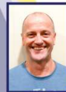
Peter Flaherty Buildings, Grounds & Environment Committee